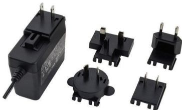
AC-DC Power Supply 12 Volt DC 3 Amper (34002625)