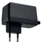
AC-DC Power Supply 12 Volt DC 1 Amper (34030041)

Note: 34002625 Europe blade included. Please contacts Essentra for other blades.